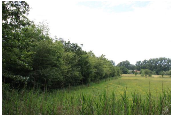
Houtland Regionaal Landschap 2020