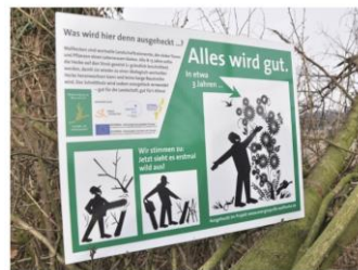
Kreis Steinfurt 2013