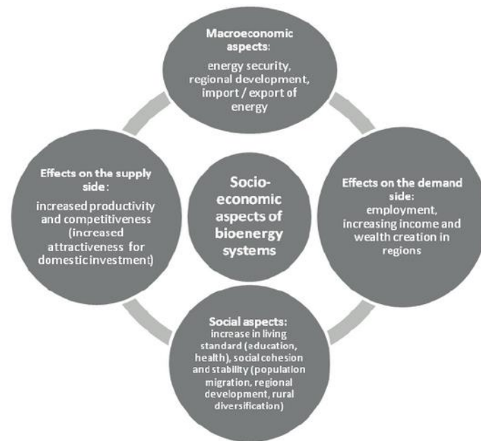
Figure 3. Socio-economic aspects of bioenergy systems for local and regional development

Source: Domac, Richards, Risovic, 2005: 98–100.